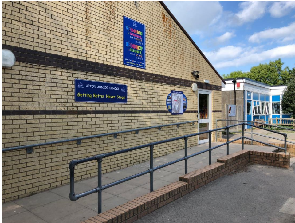
The Year 3 door.

My teacher will take me and my new class, through the door to the classroom.