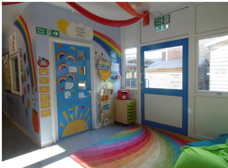
The Rainbow Room